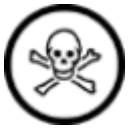
D1A - Very Toxic